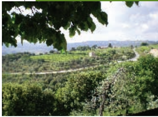
Majestic view of Chianti.