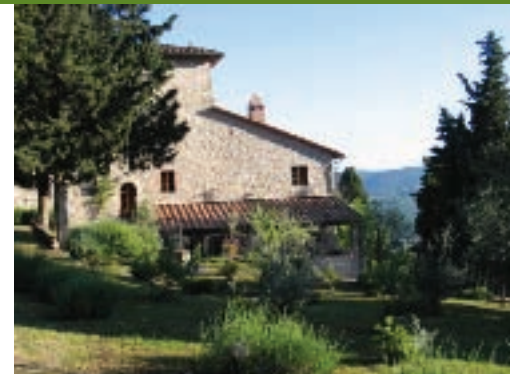
Casa Di Sopra (our villa).