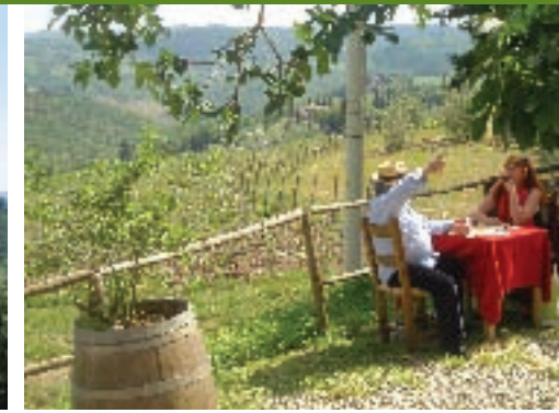
Eating lunch "al fresco" at the Cantinetta di Rignano.