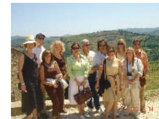
Tavola Mia Tuscan tour group.