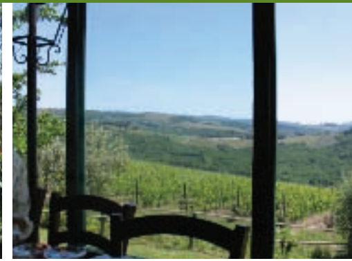
Gazing out from La Cantinetta di Rignano.