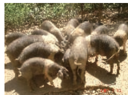
Cinta Senese pork farm