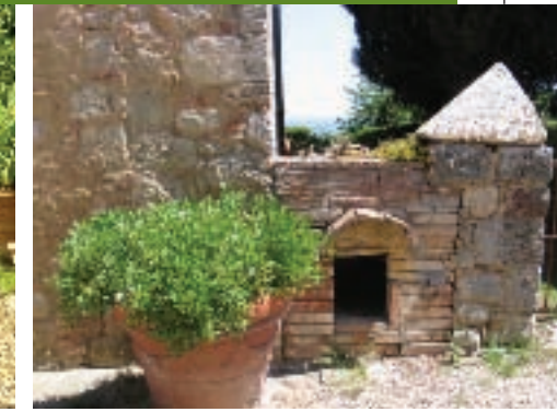
Dog House in Siena (even the dogs live the "dolce vita").