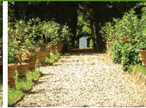
Limonaia estate in Panzano.