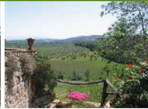
View from Fattoria Campriano.