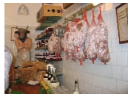
Antica Macelleria Cecchini in the Panzano region